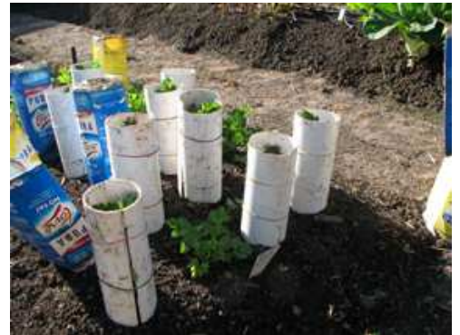
Blanching celery plants using milk cartons or polypipe.