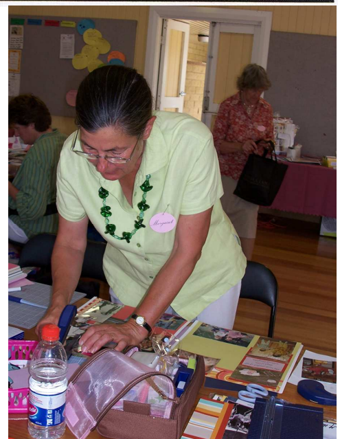
Busy scapbookers at work in the Dilston Hall